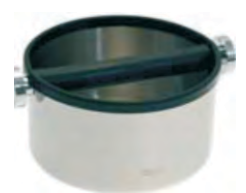
COMPLETE DRAWER FOR COFFEE