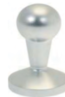
ALUMINIUM COFFEE TAMPER