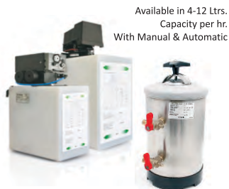
Available in 4-12 Ltrs. Capacity per hr. With Manual & Automatic