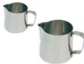
MILK PITCHER 0.50 Lt MILK PITCHER 1 Lt